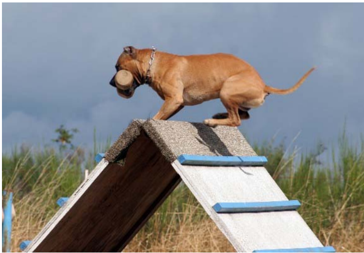
(A Pit Bull performs the agility portion of a working dog trial.)

Myth 8) "The only thing Pit Bulls are good for is dog fighting." Unfortunately, a large amount of attention has been brought to the fact that the Pit Bull was originally created for fighting other dogs in the pit. Since the breed was selectively bred for and excelled at this task, there is a common assumption that fighting must be all for which the breed is good. The truth of the matter is that the Pit Bull is one of the most versatile of canines, capable of excelling at just about any task its owner asks it to complete. This breed is routinely used for: obedience trialing, conformation showing, weight pull, agility, and has even been known to participate in herding trials, search and rescue work, and a variety of other tasks including police and armed services work. But fanciers will argue that the task this breed performs best of all is that of beloved companion.