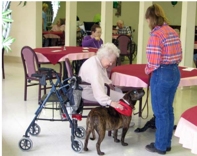
(A therapy Pit Bull makes the rounds at a nursing home.)