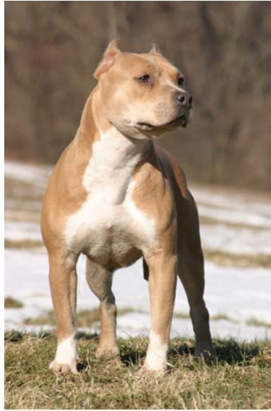
(An AKC-registered AmStaff.)

Some people consider AmStaffs and Pit Bulls to be one and the same breed since all AmStaffs can be registered as Pit Bulls with the UKC and ADBA. However, others maintain that AmStaffs have now diverged into a separate albeit very similar breed because Pit Bulls cannot be registered as AmStaffs with the AKC. This author believes that AmStaffs and Pit Bulls are the same breed, different in name only.