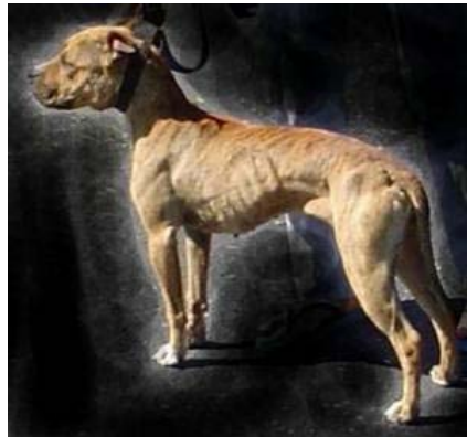
(An example of an ADBA-registered Pit Bull.)

What does a Pit Bull look like? Because the American Pit Bull Terrier is a purebred recognized by established registry organizations, the breed has its own unique standard. A standard is a written description of a particular breed, which outlines the ideal specimen, physically and temperamentally. The United Kennel Club (UKC, founded in 1898) and the American Dog Breeders Association (ADBA, founded in 1909) each have similar written standards that describe what their version of the ideal Pit Bull should look like. (These two organizations are the oldest, most sought-after, and reputable Pit Bull-registering bodies, and their standards are the most respected standards.) The standards list desirable traits as well as faults. Dog show judges use standards to judge dogs in the show ring, and responsible breeders follow the standards closely when selecting breeding stock. Pit Bulls (as well as other breeds) maintain a certain amount of uniformity in looks and in temperament because breeders follow standards.