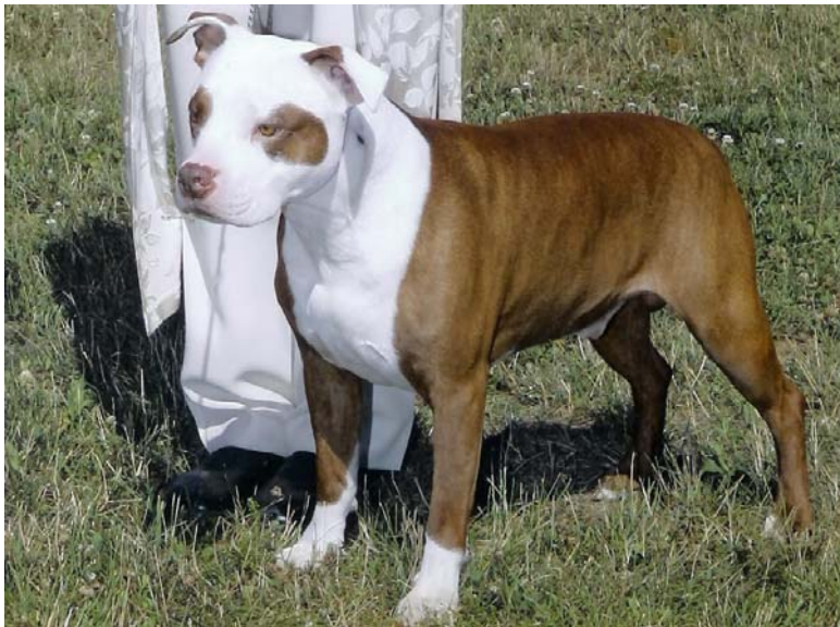
(A UKC-registered Pit Bull.)

general appearance in the Pit Bull. It is because of this variety that many people have a difficult time identifying the breed. Unless one is familiar with all the variances, many Pit Bulls may be overlooked as Pit Bull mixes or completely unrelated breeds. Pit Bulls may weigh between 20 and 100 pounds, approximately, although the average (standard-sized) dog is around 60 pounds. Recently, the trend has been towards breeding dogs that are oversized (an oversized dog would generally be considered any dog over about 70 pounds). These dogs are not considered standard or typical, and usually are the products of unethical and uneducated breeders. Some of these dogs may not even be purebred, but rather Pit Bulls crossed with larger breeds such as the various mastiffs.